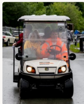
Accessible Overground Tour

*Please note the buggy can only hold one wheelchair and 5 seated.