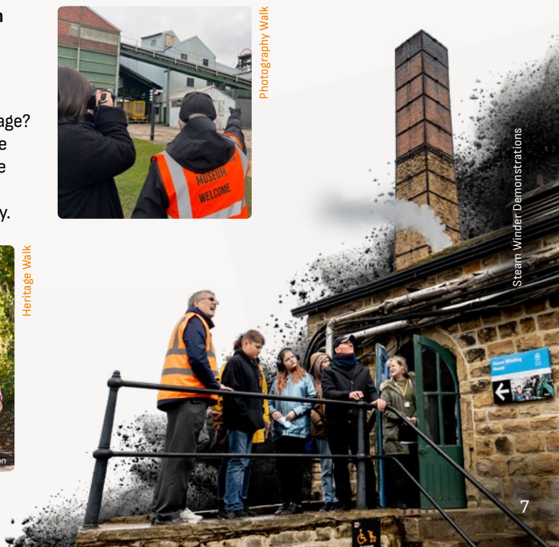
Steam Winder Demonstrations