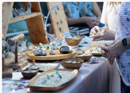
Little Hummingbird Market

Explore a diverse collection of local artisans and makers offering handmade crafts, unique gifts, and more. Enjoy a day of shopping and support small, independent businesses. Perfect for the whole family!