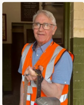
Pithead Baths Explore

Find out more about the lives, interests and lifestyles of miners on this fun family friendly tour.